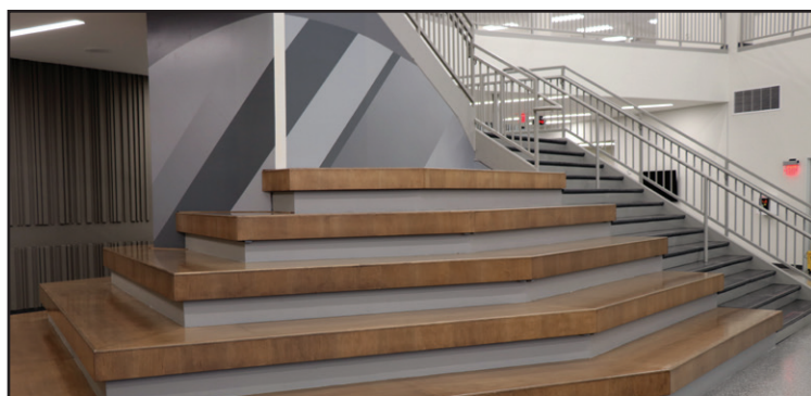
Learning stairs are adjacent to the commons.