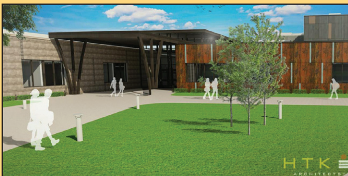
Renderings of the new Canyon Creek Elementary show how the front entrance is designed.