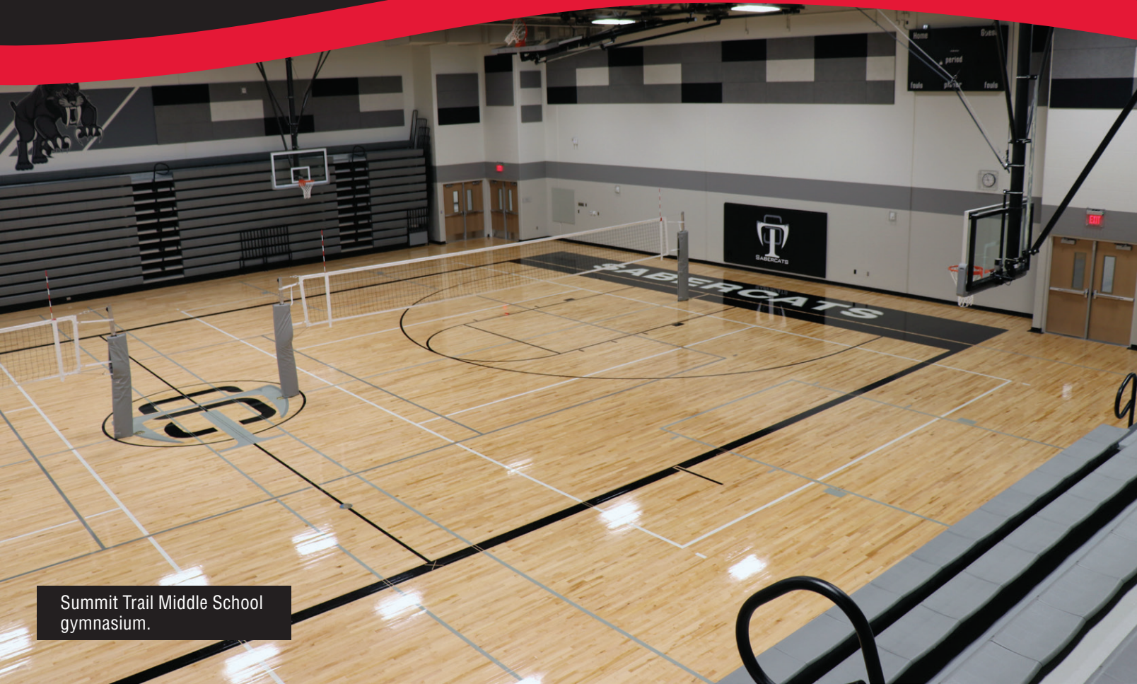
Summit Trail Middle School gymnasium.