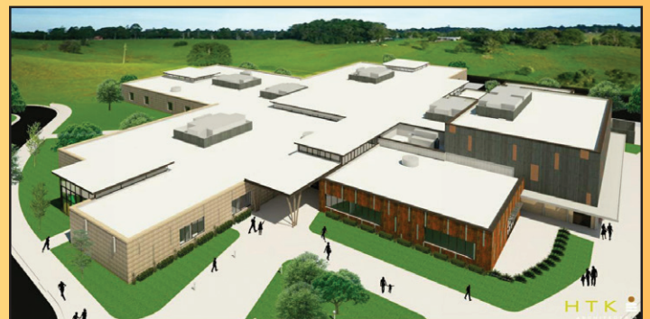
Canyon Creek Elementary rendering from a bird's eye view.

Lenexa will be home to the district's newest elementary school in August 2019. Canyon Creek Elementary, 24001 W 97th Terrace, Lenexa, will be the 36th elementary school in the Olathe School District. Before the spring semester of the 2018-19 school year, district leadership will announce Canyon Creek's first