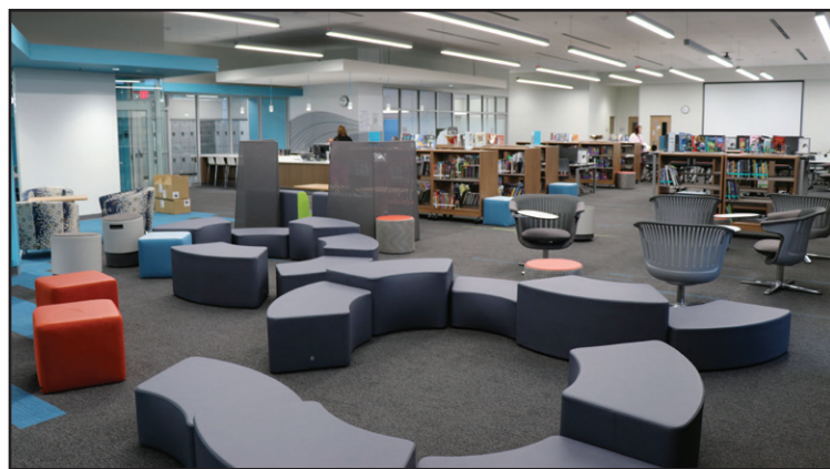
Flexible furniture is a feature of Summit Trail's library.