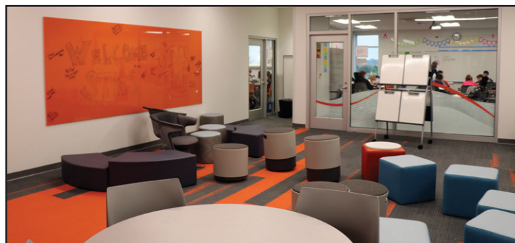
Flexible pod spaces allow for innovative learning opportunities for teachers and students.