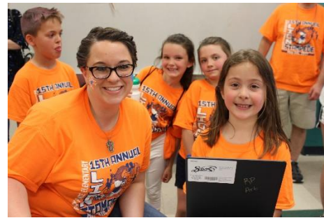
Lion Stampede 2018 "License to Roar!"