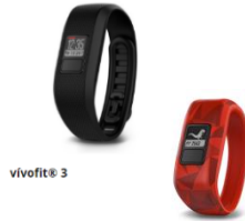
Garmin Family Fitness Pack: 2 Vivofit 4 & 2 Vivofit Jr 2 Courtesy of the Shirley Family