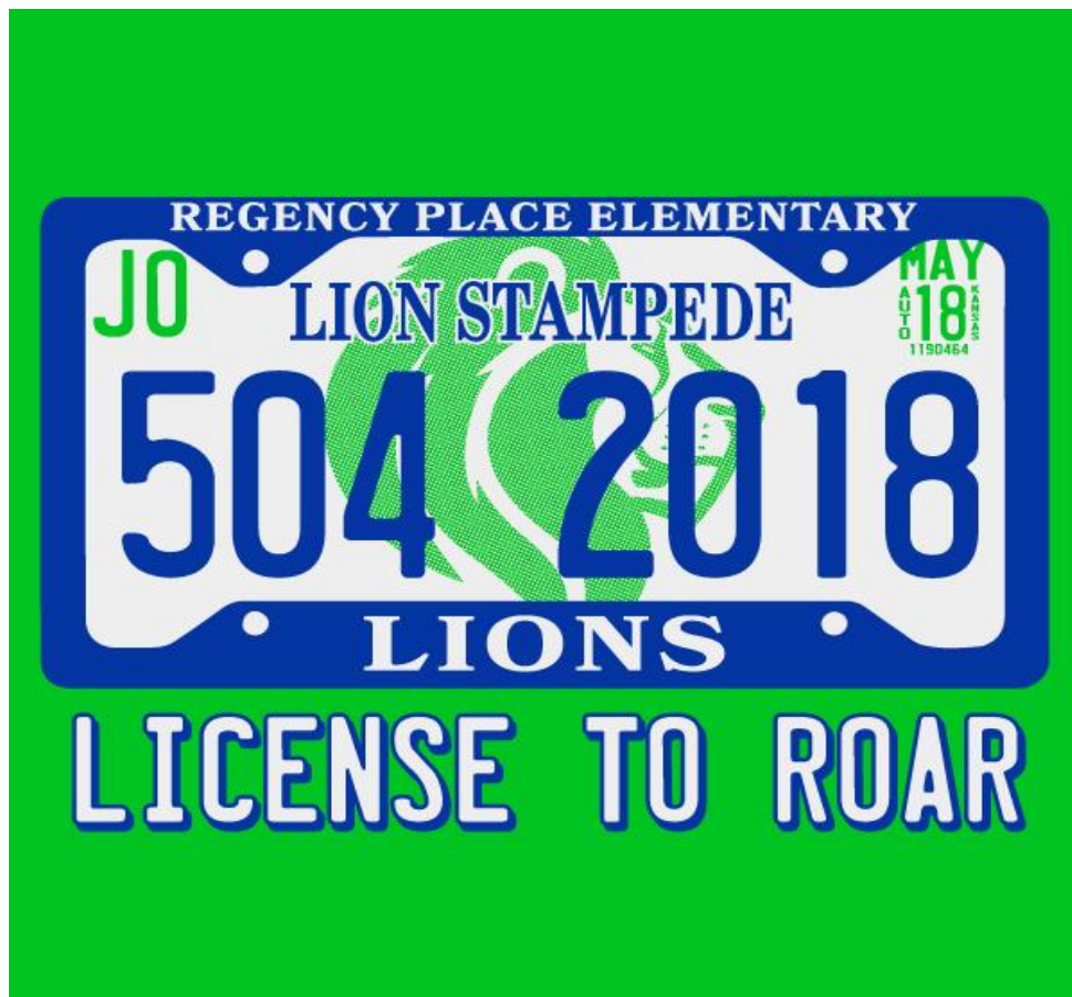
Lion Stampede 2018 "License to Roar!"

T-Shirt design selection made by 1st Grade as winners of the t-shirt jug contest!