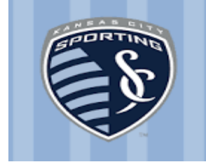
Sporting KC Tickets (3) & Parking to 6/23/2018 game Courtesy of the Seidel Family