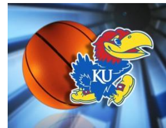
KU Hoop It Up Pack: signed basketball & more Courtesy of Zygmunt Family

Winners of the raffle items will be posted outside the main doors at 8:00pm!!