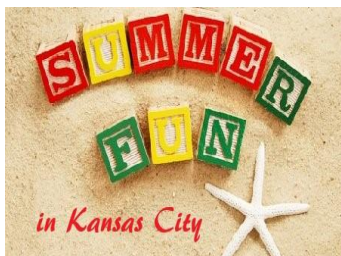
KC Summer Fun Pack: KC Zoo passes (6), Shatto tour (10), T- Bones tickets (4), Freddy's vouchers (4 combos & treats)