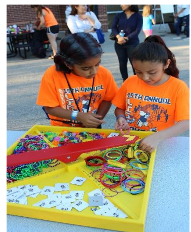
Lion Stampede 2018 "License to Roar!"