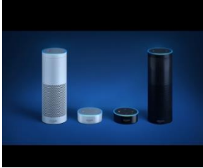
Smart Home Package: Echo, Dot & Smart Bulbs Courtesy of Adam Butler Real Estate

Be sure to check out these amazing Raffle Items! Enter for a chance to win! Boxes for the raffle tickets are located in the Gym.