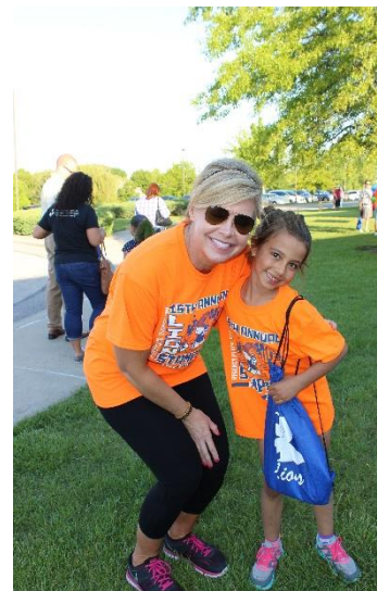
Lion Stampede 2018 "License to Roar!"