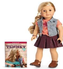
American Girl Doll - Tenney