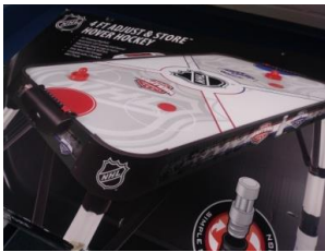
Air Hockey Table