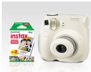
Fujifilm Instax Mini 7s Bundle: camera, case, wallet album & 2 pack film